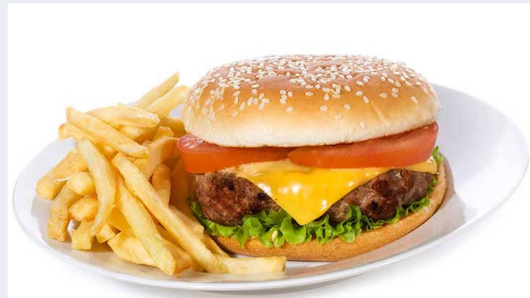
Burger with fries: Preparation time: 0 hours