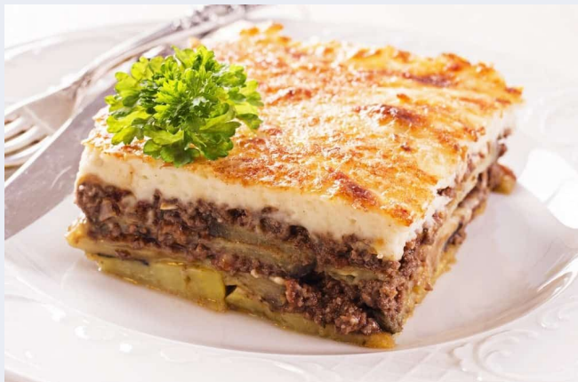
Mousaka: Preparation time: 2.5 hours