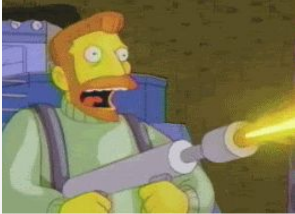
Hank Scorpio, The Simpsons ep. 155